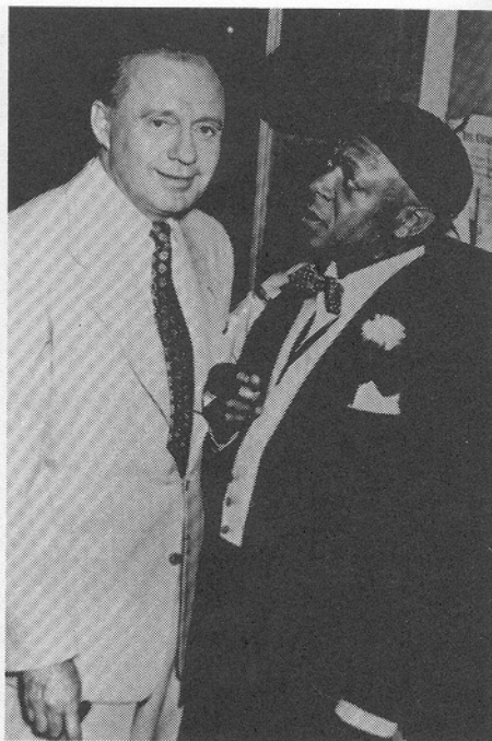
JACK BENNY AND "ROCHESTER"