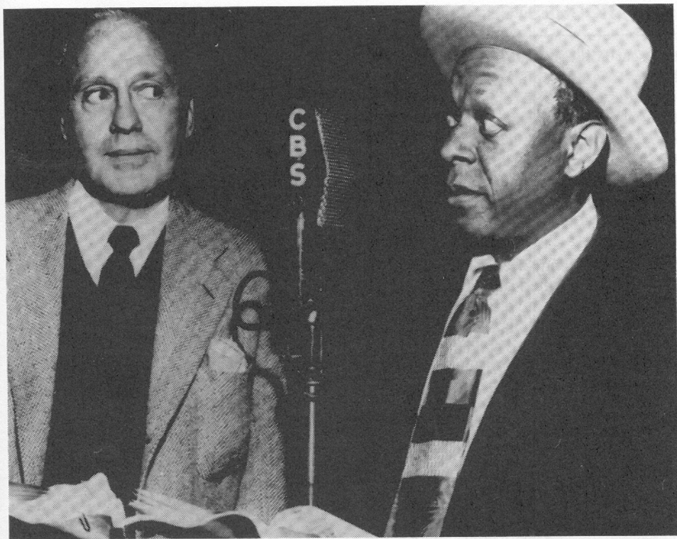
JACK BENNY and EDDIE "ROCHESTER" ANDERSON

most distinctive trademarks in radio. Hawking newspapers on Oakland's streets gave Eddie some spending money, but the theory was that the louder one yelled the more papers one sold. The future star yelled so loudly to out-sell his opposition that he permanently damaged his vocal chords. What seemed to be the death knell for a performer gave "Rochester" his distinctive raspy voice.