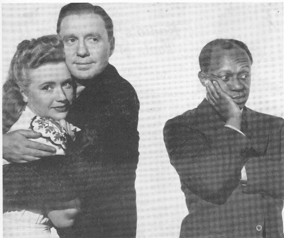
"THE MEANEST MAN IN THE WORLD" (1943) with Priscilla Lane, Jack Benny and Eddie "Rochester" Anderson.

Benny's horrible treatment/underpayment of the manservant, for the real Anderson was paid quite handsomely. It is, however, common knowledge that Eddie Anderson unnerved taskmaster Jack Benny with his tardiness at rehearsals. Anderson was notorious for being late for practice. He usually had excuses that were accepted reluctantly. After one threat from Benny, Rochester had the police escort him into the studio to vouch that he was delayed because of a traffic problem. Jack actually fired Anderson when an early Ronald and Benita Colman guest appearance was threatened by the valet's absence. Rochester was written out of the script, even though he explained that he was late because of a delayed plane arrival from San Francisco. Jack silently ignored Rochester's pleas, until Mary intervened,