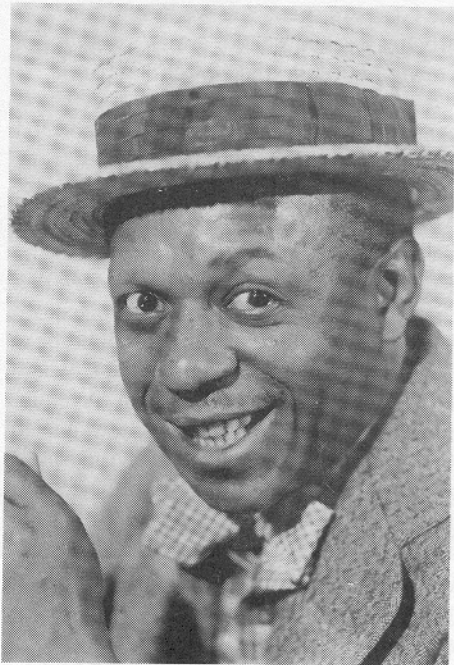
EDDIE "ROCHESTER" ANDERSON

The job that was more acceptable to Big Ed provided young Eddie with a potential disaster that was turned into one of the