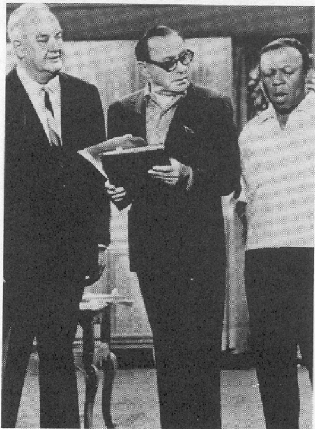
DON WILSON, JACK BENNY AND EDDIE "ROCHESTER" ANDERSON ON TV

been the subject of a controversy when, in a well-publicized case, a film in which he appeared called "Brewster's Millions" was banned in Memphis. The problem, according to a local newspaper, was that the film portrayed "too much social equality and racial mixture." Prior to this 1945 film, Benny had boosted his black cohort's posture when the film "Buck Benny Rides Again" experienced its world premiere in Harlem's Victoria Theater. An enthusiastic crowd, urged on by mc Bill "Bojangles" Robinson, roared its approval as Rochester entered the stage smoking, as he said, one of "Mr. Benny's cigars." In another instance of support, Benny checked out of a hotel that suggested, by this time famous, Rochester's occupancy might upset some customers from the South. The former son of a Jewish immigrant, Benny Kubelsky, also left a restaurant with his entire entourage when a similar suggestion to remove Rochester from the group was made.